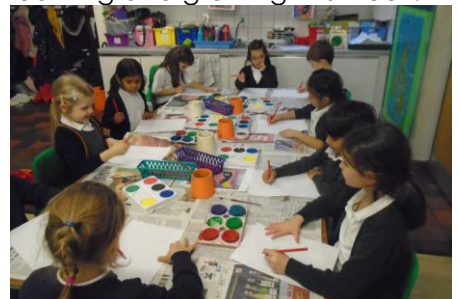
Y1 Art - Picasso

The children have been busy learning and growing this week.