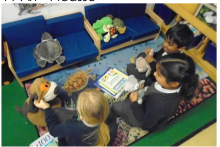
Enjoying our reading areas.